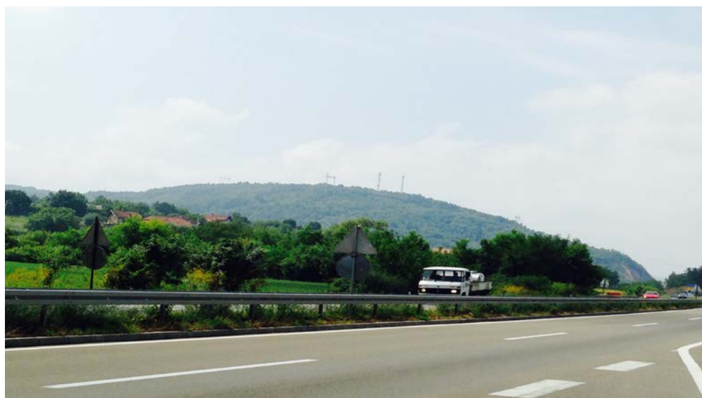
View of existing 400 kV transmission lines in Kragujevac.