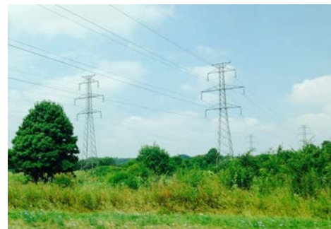
Low voltage transmission lines on the Kragujevac – Kraljevo route

The Kragujevac – Kraljevo section is on the list of Projects of Energy Community Interest, being located in one of the Energy Community Treaty Contracting Parties (Western Balkans countries, Moldova, and Ukraine). It will upgrade the electricity distribution system in Central and Western Serbia and interconnect it with systems in the neighbouring EU states.